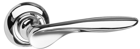
Product Finish Pictured: Polished Chrome